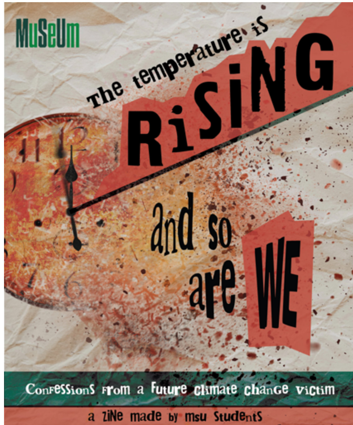
Front cover of the zine produced by the CoLaborators