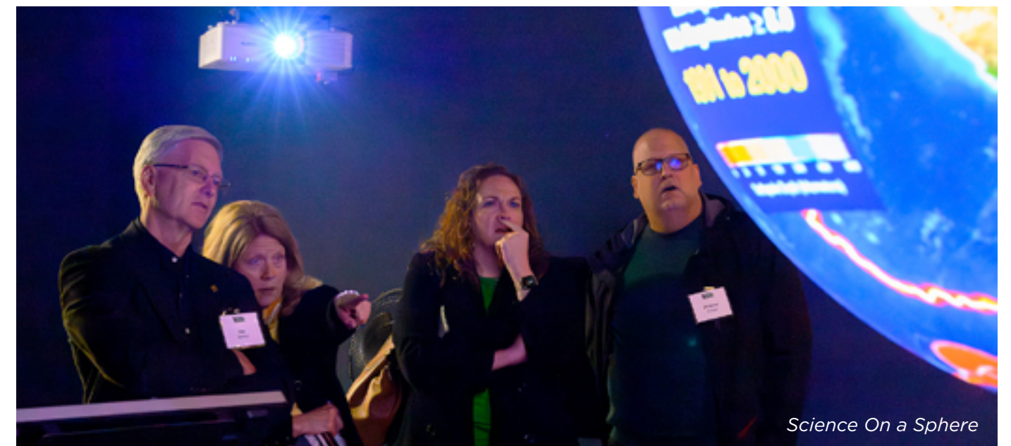
Science On a Sphere

In addition, the Museum staff collaborates intimately with faculty members to extend the impact of new research through carefully designed exhibitions and educational programming. This commitment includes supporting Broader Impacts — the potential societal benefits emanating from a research project — in relation to grants awarded by the National Science Foundation. Furthermore, the Museum staff work directly with faculty to generate and distribute geophysical, environmental, and cultural data visualizations through the innovative Science On a Sphere (SOS) platform, which features a six-foot diameter immersive visualization display. Additionally, the SOS system was utilized for teaching, with over 500 students creating custom content for the system during classes.