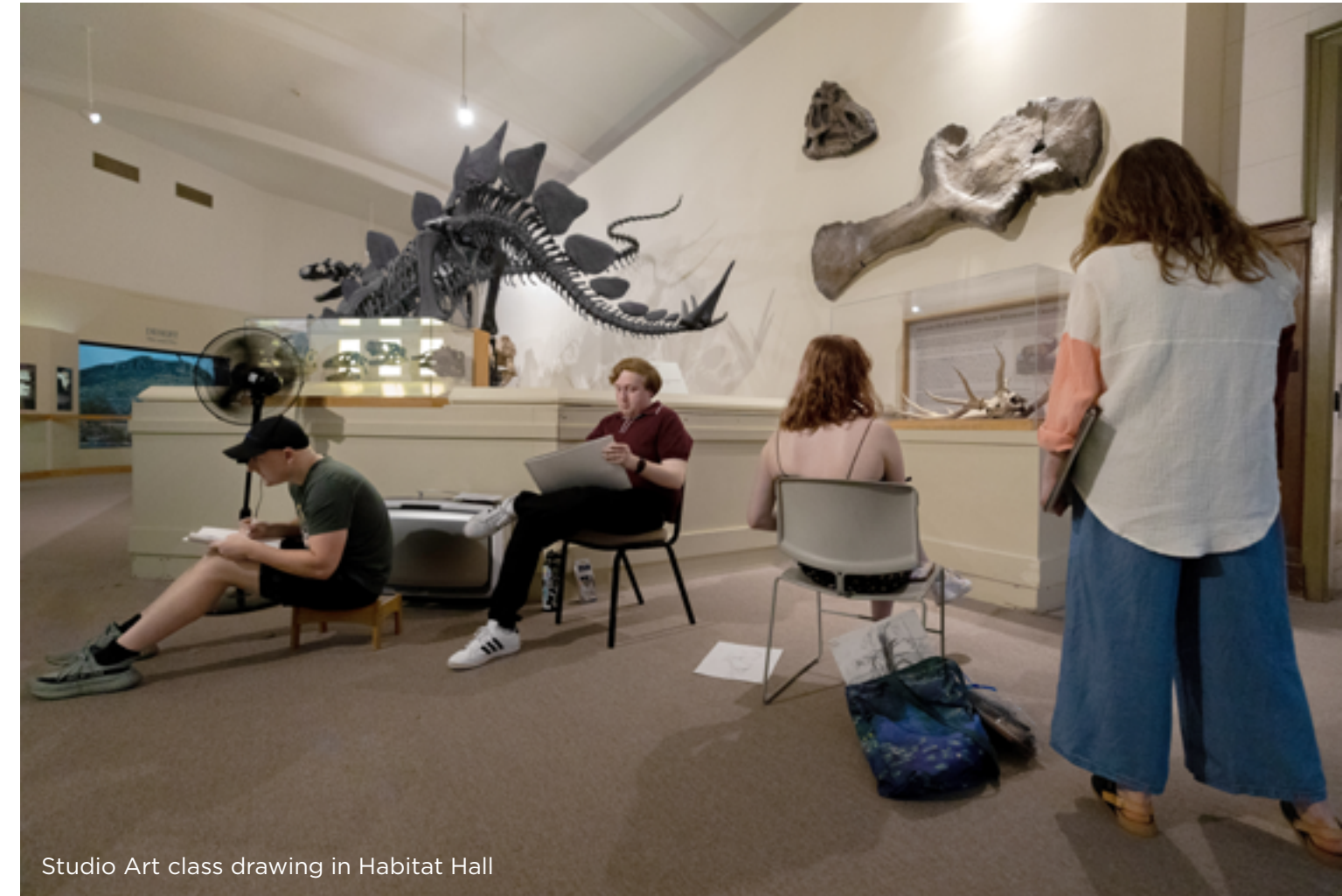
Studio Art class drawing in Habitat Hall

Additionally, the Museum serves as a vital "third place" for students to express their creativity and indulge their curiosity through extra-curricular activities. In the past year alone, the Museum organized over seventy-five timely and relevant public programs. Notably, our inaugural First Fridays program series for college students attracted an average of 150 attendees per event, successfully providing students with a space to build and foster social connections while engaging with the Museum's offerings.