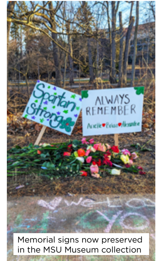
Memorial signs now preserved in the MSU Museum collection